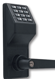
DL2700/19 Matte Black