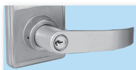
Regal handle option

Programming: Locking modes, event schedules, group, individual, master, management, passage, emergency service codes. Lockout, remote override capability and allowable entry time (3, 10 or 15 seconds), are programmable through the keypad, AL-DTMIII or Alarm Lock's DL-Windows PC Software.