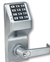
With IC Core in 26D DL2700IC/26D

Trilogy is available in many additional models, including those for outdoors, and/or Mortise, exit trim panic devices, plus with Prox ID card reader, dual-sided keypads, wireless lock networks and more.