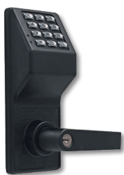
NEW! DL2700/19 Matte Black

Programming: Locking modes, event schedules, group, individual, master, management, passage, emergency service codes. Lockout, remote override capability and allowable entry time (3, 10 or 15 seconds), are programmable through the keypad, AL-DTMIII or Alarm Lock's DL-Windows PC Software.